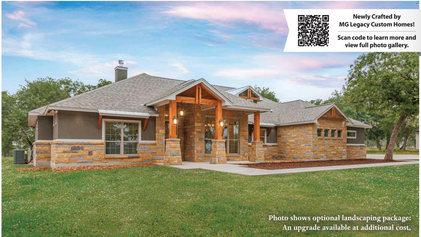
Photo shows optional landscaping package: An upgrade available at additional cost.

Scan code to learn more and view full photo gallery.